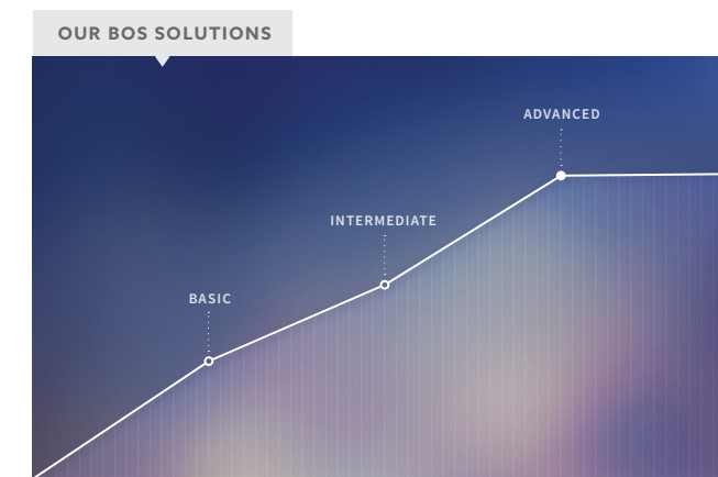
A Basic BOS portal provides links but little or no integration. The Intermediate adds integration with early partner agencies and links to other agencies, allowing prospective partner agencies to observe the success of the core portal and later commit to full portal integration, as with the PCC Advanced BOS.

Business One Stop models come in all forms. Many combinations begin with a gateway agency like the Secretary of State's business filing office, and initially pull in other agencies that allow customers to sensibly accomplish business needs in a single-session, single-transaction environment. Examples include the state revenue department and the state departments of consumer protection, labor and environmental protection. Between these five agencies, an entrepreneur can fill out universal forms that satisfy all of their registration, licensing, and permitting requirements. The technology pre-populates data already entered by the customer into the corresponding fields of the other agencies' forms to diminish repetitive data entry.