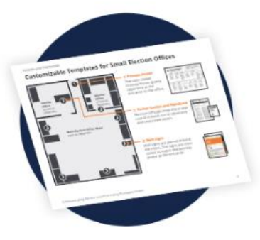
Communicating Election and Post-Election Processes Toolkit