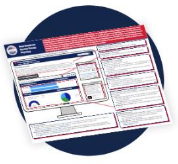
Best Practices: Election Results Reporting,