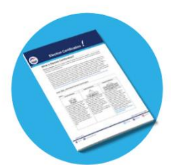
Guide to Election Certification