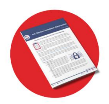
Checklist for Securing Election Night Results Reporting